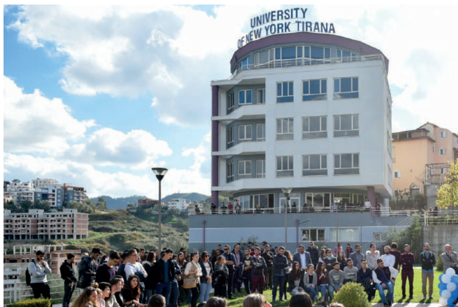
University of New York Tirana is a university managed by the Turkish Maarif Foundation in Albania.